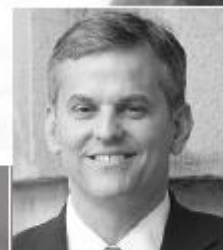
NC Attorney General Josh Stein