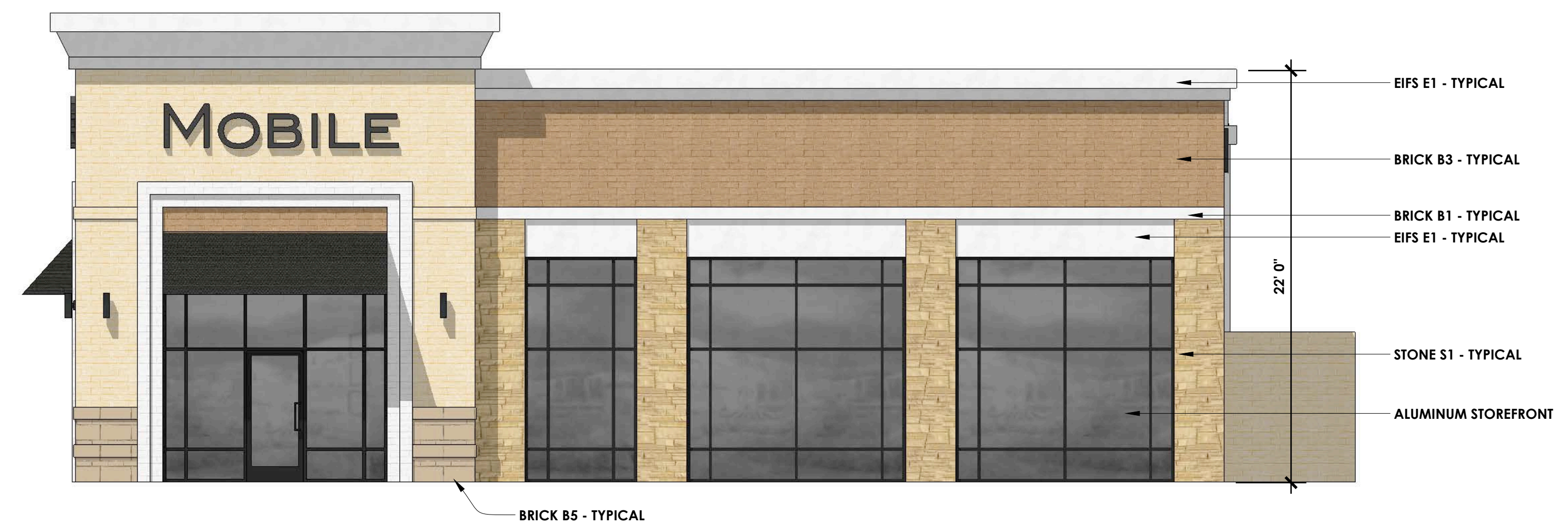
2 RIGHT ELEVATION 3/16" = 1'-0"