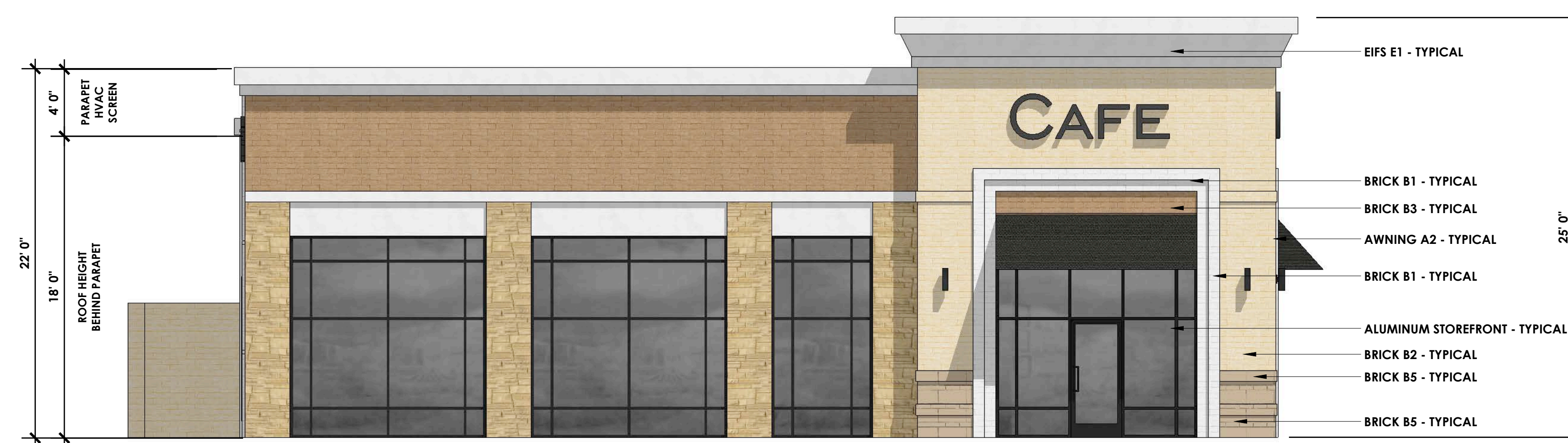
1 LEFT ELEVATION 3/16" = 1'-0"