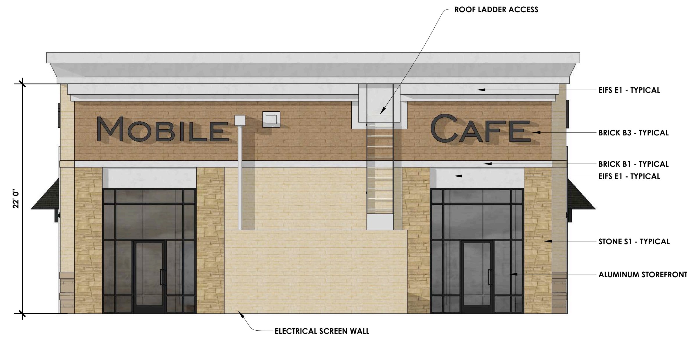
4 BACK ELEVATION 3/16" = 1'-0"